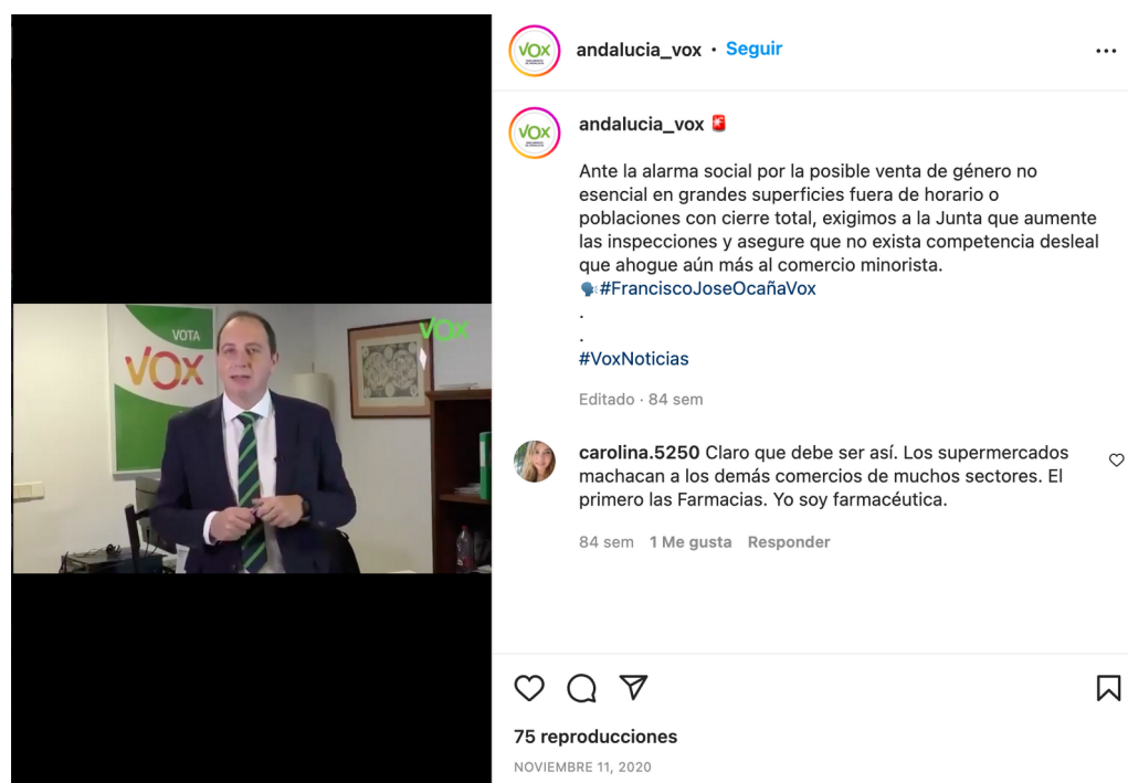
Figure 3. (VOX Parlamento de Andalucía, 2020)

A (32%); proportionally, no other party has devoted so many publications to a specific topic. Moreover, this theme is addressed most often by all of the parties, except for three: Anticapitalistas-A, PP-A, and PSOE-A. In the first, gender/feminism stands out; in the second, the “campaign and/or political parties” topic; in the third, “health and social welfare”.