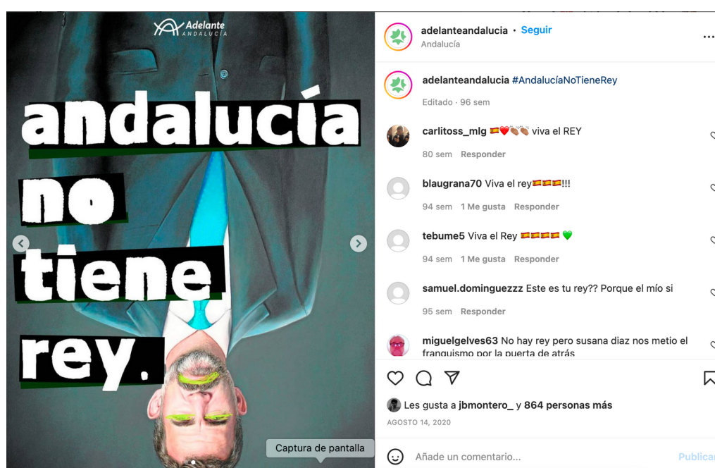
Figure 4. (Adelante Andalucía, 2020)