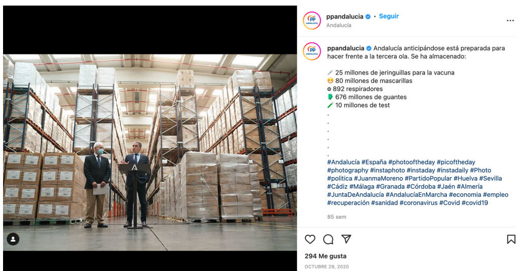
Figure 2. (PP de Andalucía, 2020)